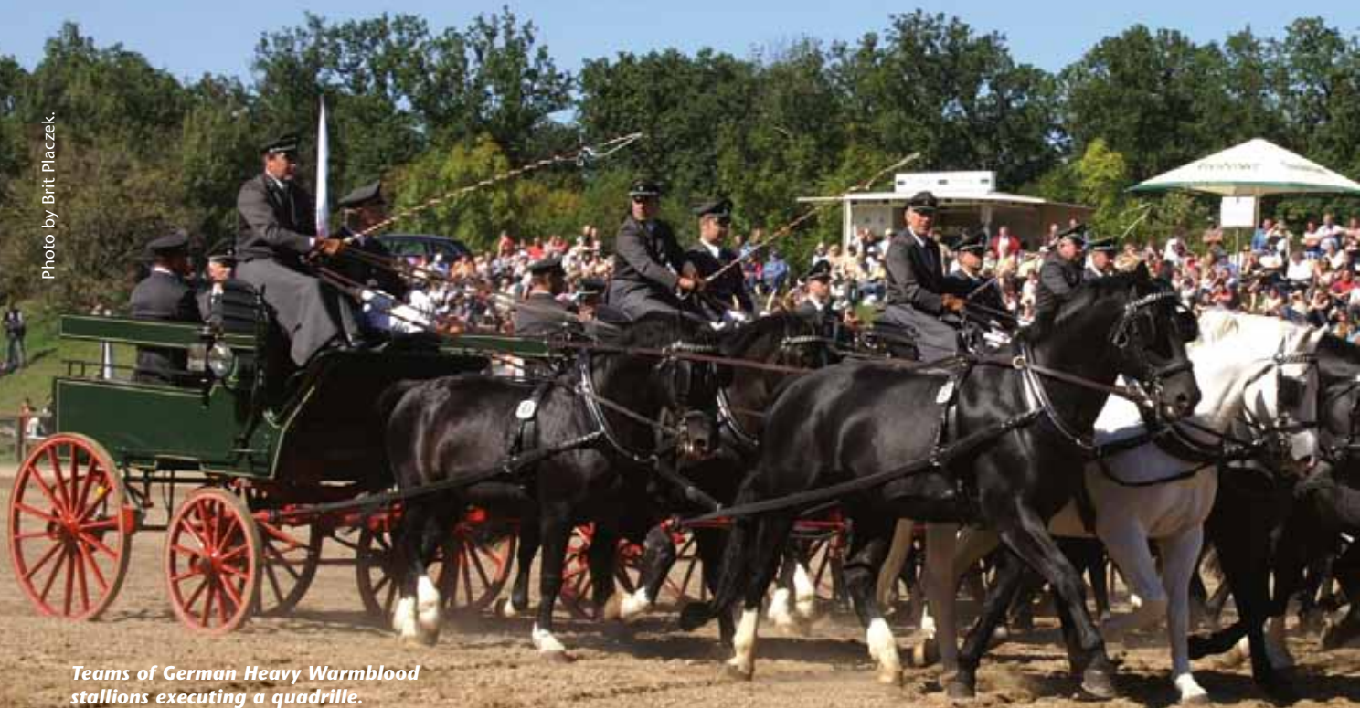
Teams of German Heavy Warmblood stallions executing a quadrille.