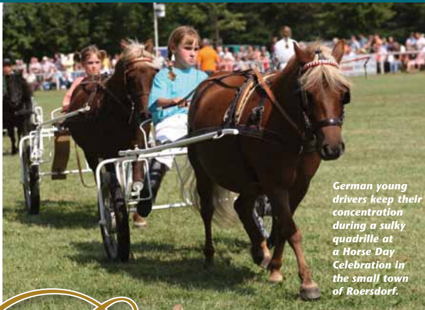
German young drivers keep their concentration during a sulky quadrille at a Horse Day Celebration in the small town of Roersdorf.